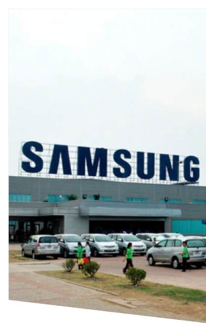
SAMSUNG ELECTRONICS VIETNAM THAI NGUYEN

Import and transporting the entire production line of the Toyoda factory